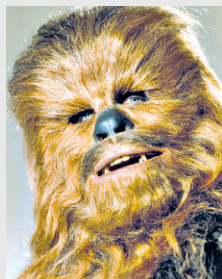
May 27, 28, 29 Peter Mayhew Chewbacca