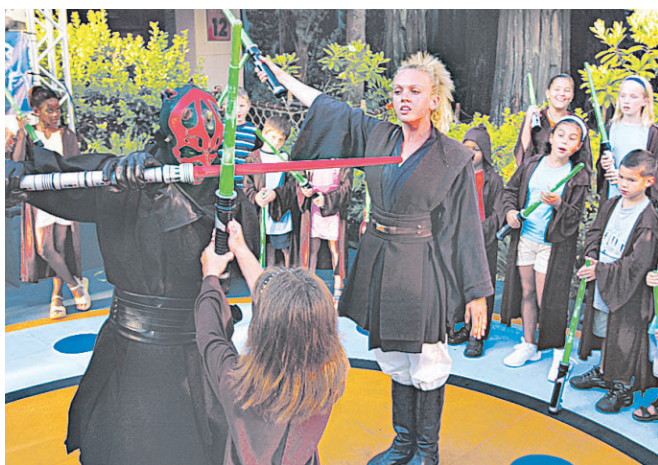
A graduate of the Jedi Training Academy faces off against Darth Maul.