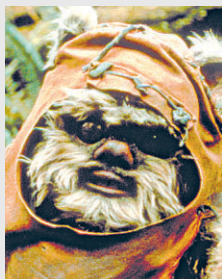
June 3, 4, 5 Warwick Davis Wicket the Ewok