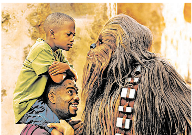
A young fan enjoys a face-to-face moment with Chewbacca.